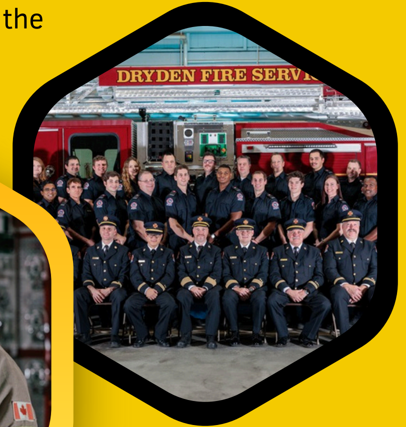
The heart and soul Dryden Firefighters